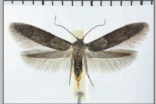
Fig. 3 – Blastobasis huemeri Sinev, 1993 from Pálava Hills in southern Moravia.

K článku T. Příbyla na stranách 178 až 182 Figures for the paper of T. Příbyl, pp. 178 – 182