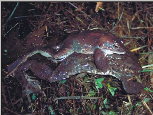
Obr. 3 – Hybridní amplexus skokana a ropuchy