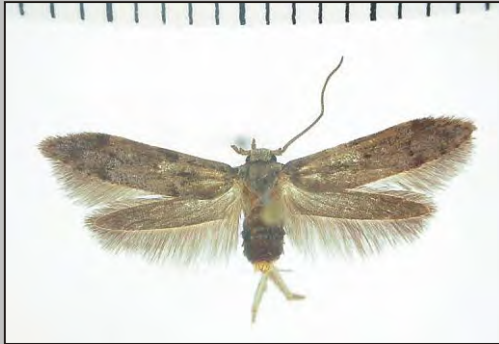
Fig. 2 – Blastobasis huemeri Sinev, 1993 from Myslivna Nature Reserve in Novohradské hory Mts. in southern Bohemia.

K článku J. Šumpicha na stranách 167 až 169 Figures for the paper of J. Šumpich, pp. 167 – 169