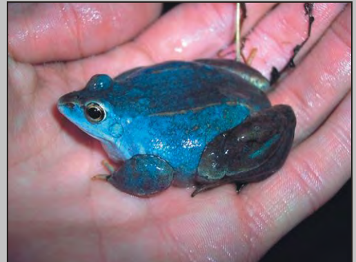
Obr. 2 – Rana arvalis