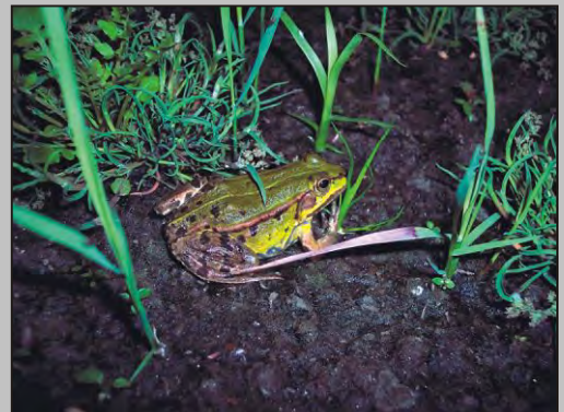
Obr. 4 – Pelophylax lessonae