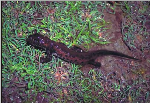
Obr. 1 – Triturus cristatus

K článku T. Příbyla na stranách 178 až 182 Figures for the paper of T. Příbyl, pp. 178 – 182